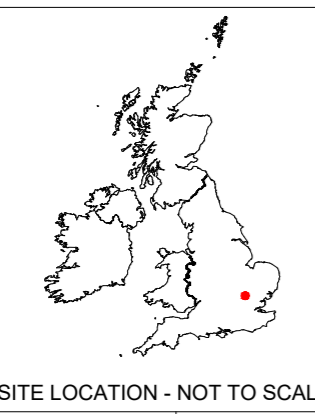
SITE LOCATION - NOT TO SCALE

KEY: SITE BOUNDARY (OUTSIDE EDGE OF LINE DENOTES BOUNDARY)